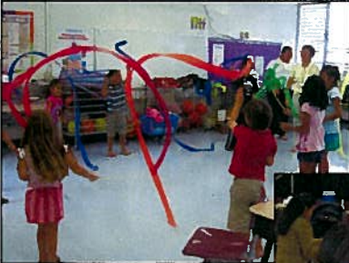
(Above) Twirling colorful ribbons keep keiki busy; (Right) Moms join discussion groups during the Motherread training session at our 4th Annual Kupukupu Conference