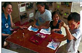
Keiki color their way through the Native Hawaiian Library booth.

Keiki of all ages ran from booth to booth, enjoying the festivities with their families at the Kamehameha School's E Kuu Lima Community Resource Fair on February 9 th at the Waimanalo preschool. Various community organizations, including ALU LIKE, Inc., offered information on early childhood, parenting, cultural, literacy and health programs available to the Ko'olaupoko community.