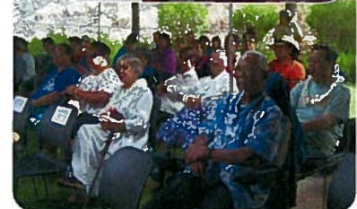
The ho'omaika'i program included a ho'okupu and mele during the Library Open House on April 30

Our purpose is to kokua Native Hawaiians with access to information and to provide materials and services that foster reading and lifelong learning.